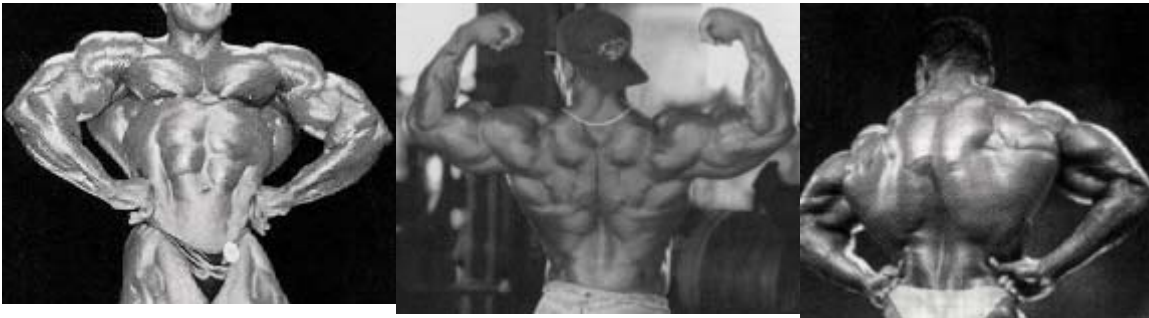
Front Lat Spread